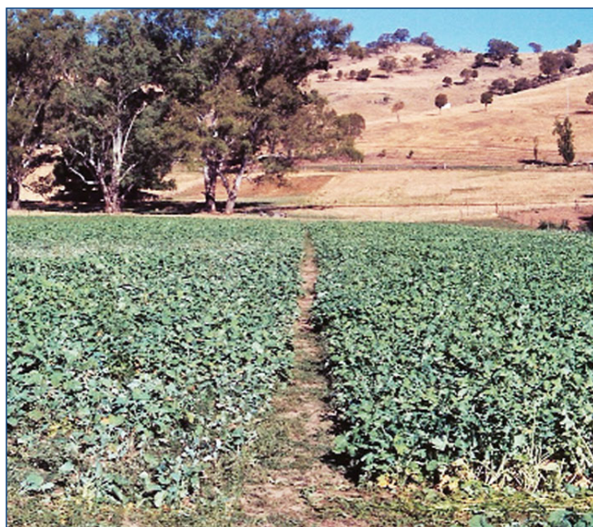
Goliath rape (right) showing increased yield and pest resistance compared with Bonar (left). Goliath has now replaced Bonar in Australia.